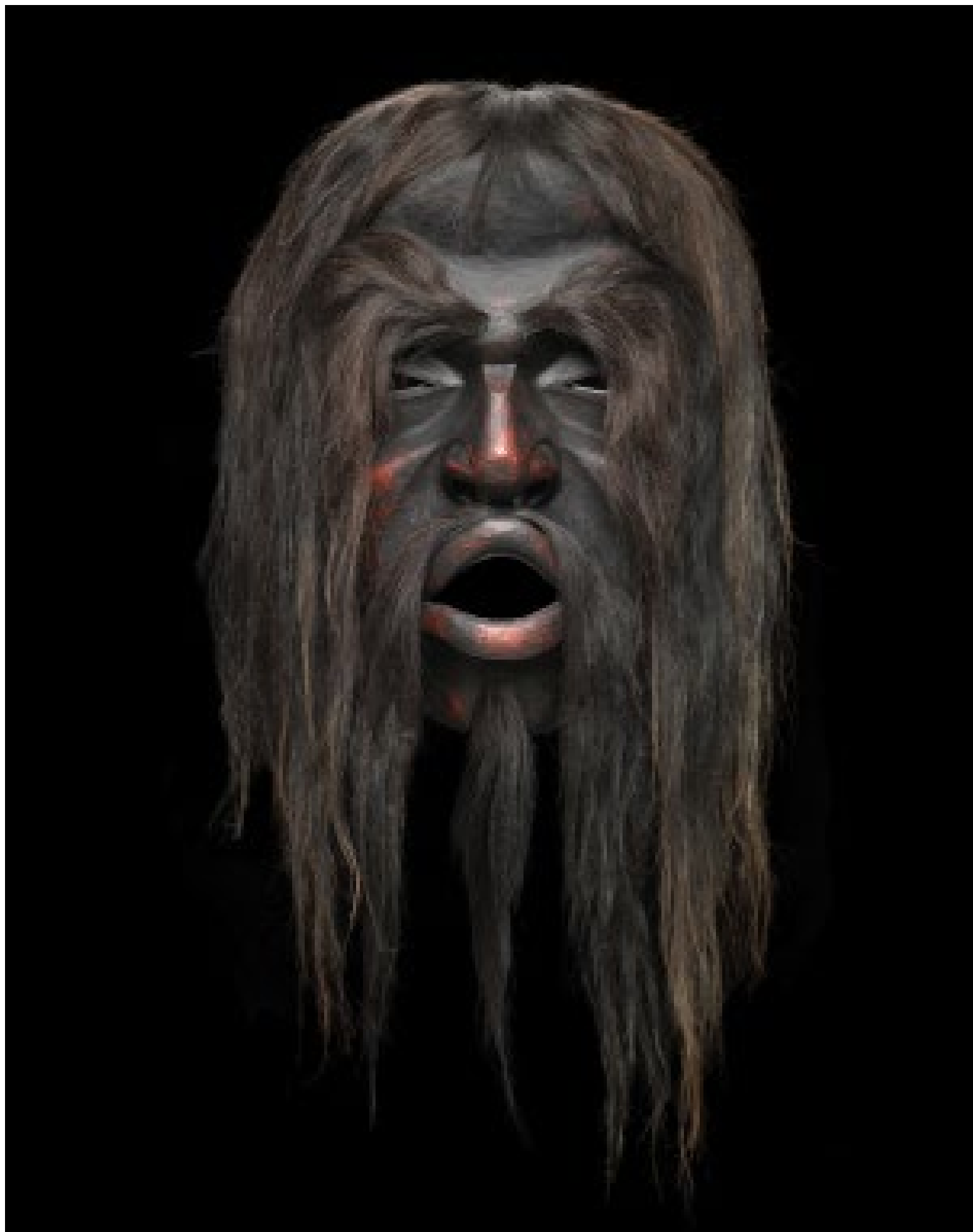
Beau Dick, Dzunukwa Mask (2007), red cedar, pigment, horsehair, 133 x 65 cm. Collection Audain Art Museum, Whistler