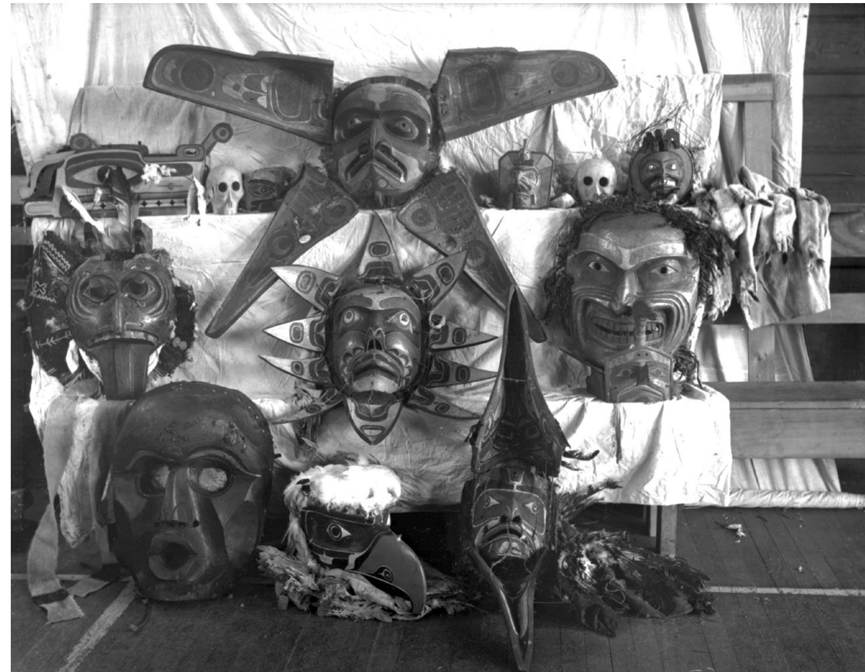
A collection of dance masks, Anglican Church parish hall, Alert Bay, BC, ca. 1922.