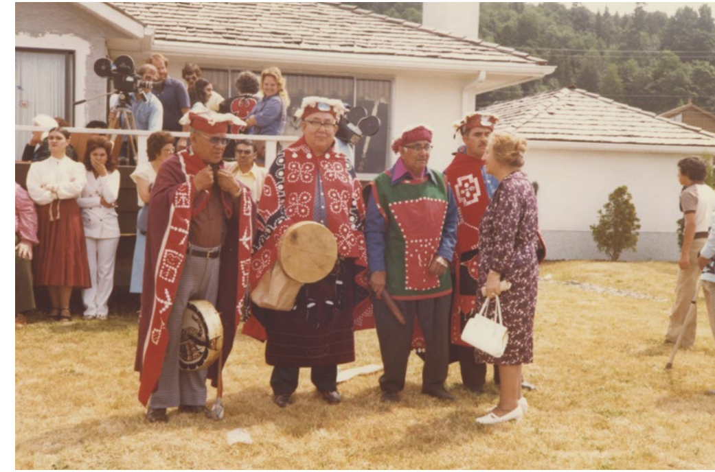
Nuyumbalees Cultural Centre, Cape Mudge, BC, 1979.

The Kwakwaka'wakw people make clear that dance is not only a celebration; it is an integral part of their judicial system and governance. They declare that "a strict law bids us to dance." 3 In 1975 when the return of the first set of objects taken after the potlatch of 1921 was made official, people in Cape Mudge and Alert Bay celebrated with dances that were not simply celebratory.