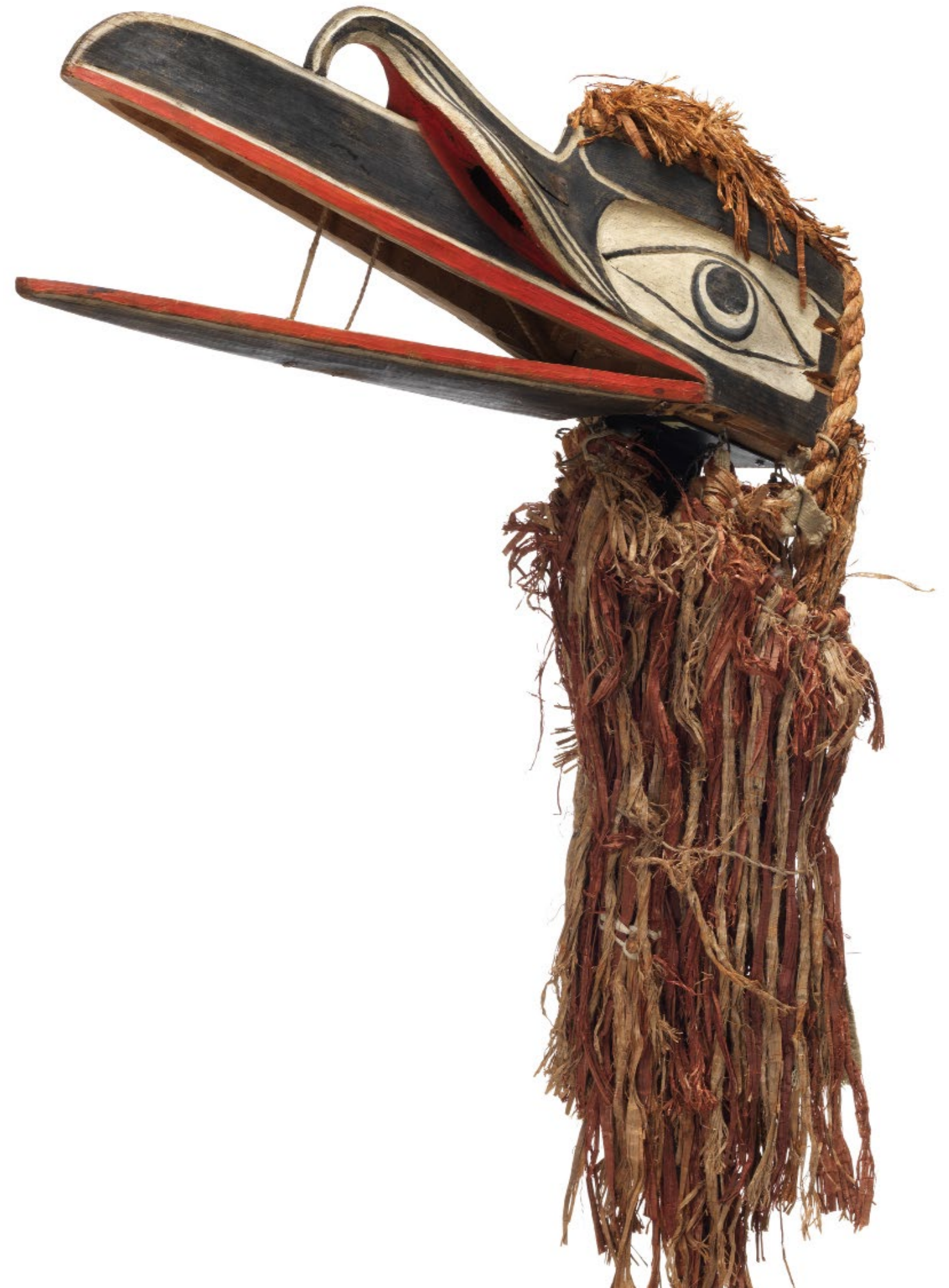
Artist unknown, Gwaxgwakwalanuksiwe (Raven at the North End of the World, date unknown), cedar wood, rope, cotton cloth, paint, metal nails, height 72 cm. Owned by Tsandigan 'Nage', Harry Mountain, Maməlilikala, Village Island

Central to this image are two large masks. Spread out they reveal three faces: two on the outside and one, humanlike, in the center. The masks are of Sisiyutʔ, the two-headed serpent. Always depicted with horns, the creature turns those who cannot face their own fears into stone. Perhaps in line with its double-headed nature, Sisiyutʔ also bestows power and wealth—warriors and chiefs still employ his image as a crest on their regalia for protection.