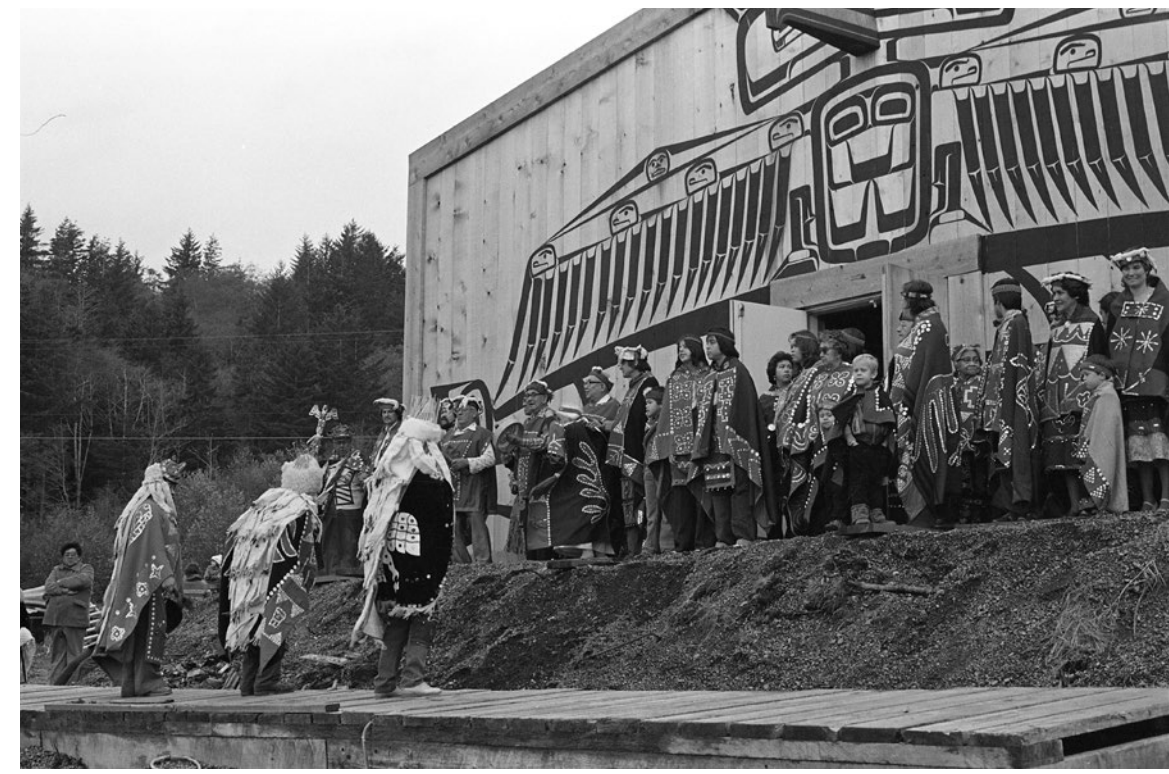
Kwakwaka'wakw community members celebrate the opening of the U'mista Cultural Centre in Alert Bay, BC, date unknown. Museum of Anthropology at the University of British Columbia, Vancouver

Above, Franz Boas is seen modeling for a diorama on the Hamat'sa. He is depicted as the "wild" dancer emerging from the threshold of the supernatural and out of the mouth of Baxwbakwalanuksiwe'. The diorama itself was based on an enactment of the ceremony that was very much out of time. In 1893 a group of Kwakwaka'wakw were brought to Chicago as part of the World's Columbian Exposition. Here they performed the Hamat'sa over and over again to an uninitiated audience, setting in motion a cycle of repetition and reiteration of the ritual that carries through to the present.