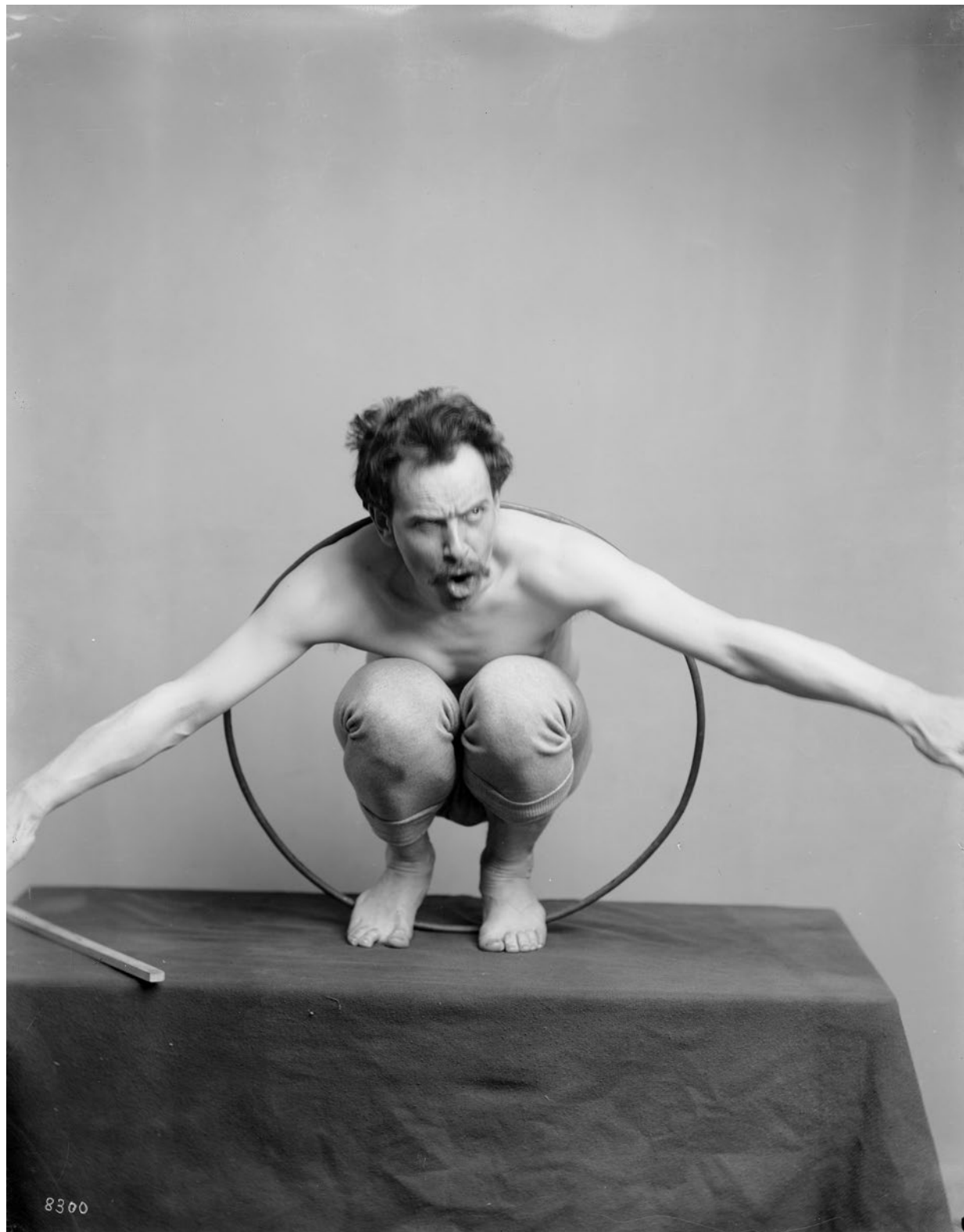
Franz Boas posing for a figure in U.S. Natural History Museum display case entitled "Hamat'sa coming out of secret room," date not recorded (1895 or before).

Above, Franz Boas is seen modeling for a diorama on the Hamat'sa. He is depicted as the "wild" dancer emerging from the threshold of the supernatural and out of the mouth of Baxwbakwalanuksiwe'. The diorama itself was based on an enactment of the ceremony that was very much out of time. In 1893 a group of Kwakwaka'wakw were brought to Chicago as part of the World's Columbian Exposition. Here they performed the Hamat'sa over and over again to an uninitiated audience, setting in motion a cycle of repetition and reiteration of the ritual that carries through to the present.