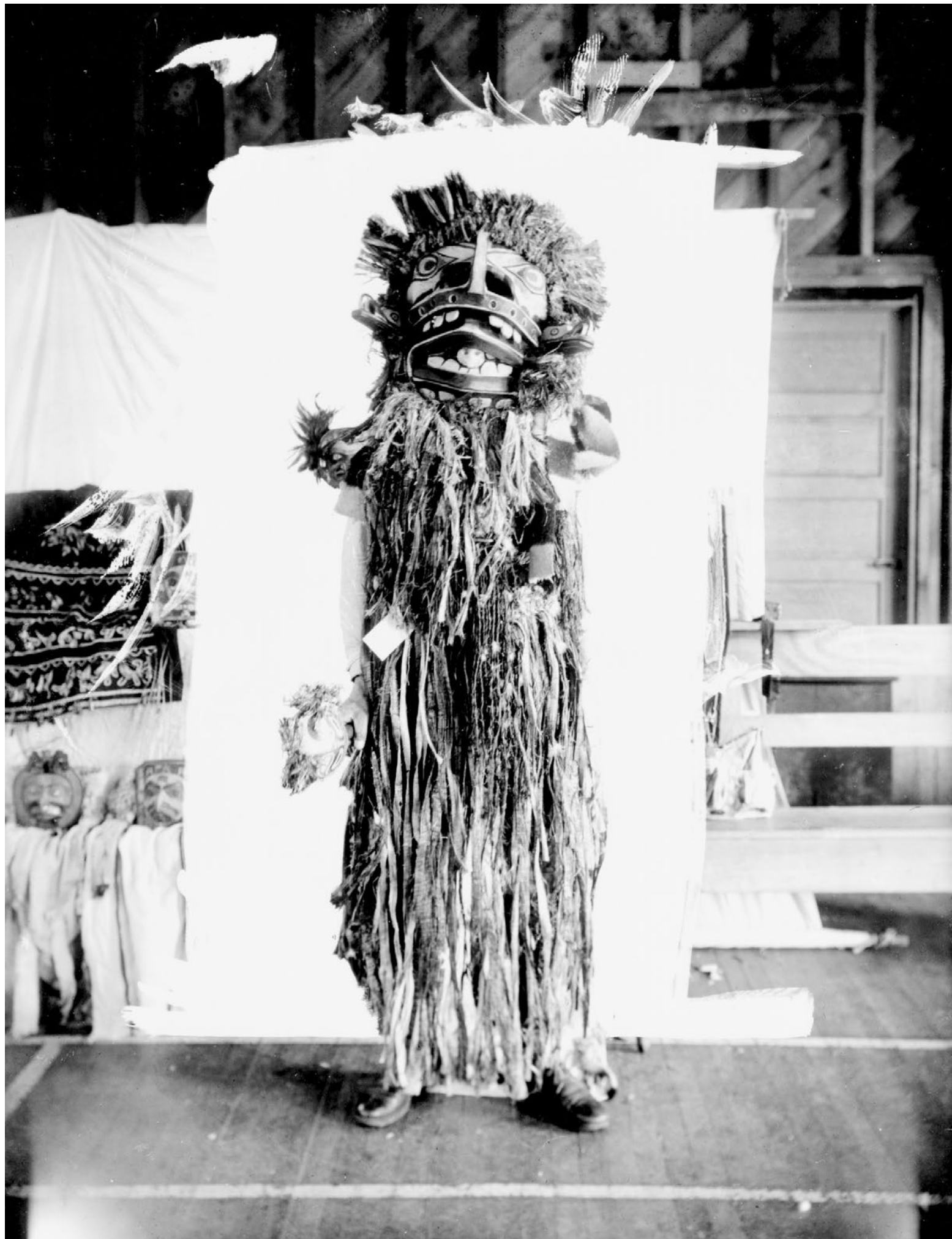
A potlatch dancer in regalia, Anglican Church parish hall, Alert Bay, BC, ca. 1922.