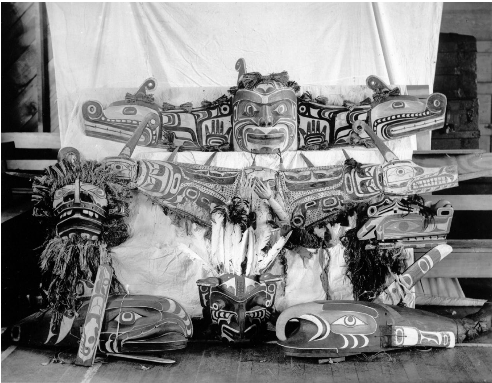
Indian ceremonial masks, Alert Bay, BC, date unknown.